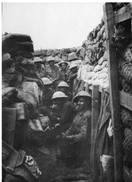
AUSTRALIAN WAR MEMORIAL AD3042

series of trenches on the Western Front. The bitterly cold and muddy conditions were beyond description. Yet the Diggers clung to their ground and pitted themselves against the opposing guns and bayonets time and time again. The first major battle was at Fromelles in July 1916. In 27 hours Australians losses doubled the entire Gallipoli campaign.