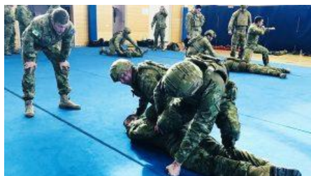
Under the watchful eye of an instructor, soldiers from the 1st Armoured Regiment, 1st Combat Service Support Team and 16 Air Land Regiment practise subduing an enemy soldier during an Army Combatives Program training session at RAAF Edinburgh.

The final component is an instructor qualification enabling the training and qualification of personal up to and including certified level of ACP.