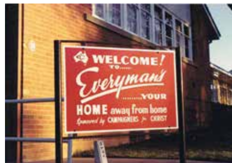
Below: One of our signs at Kapooka in the 80's