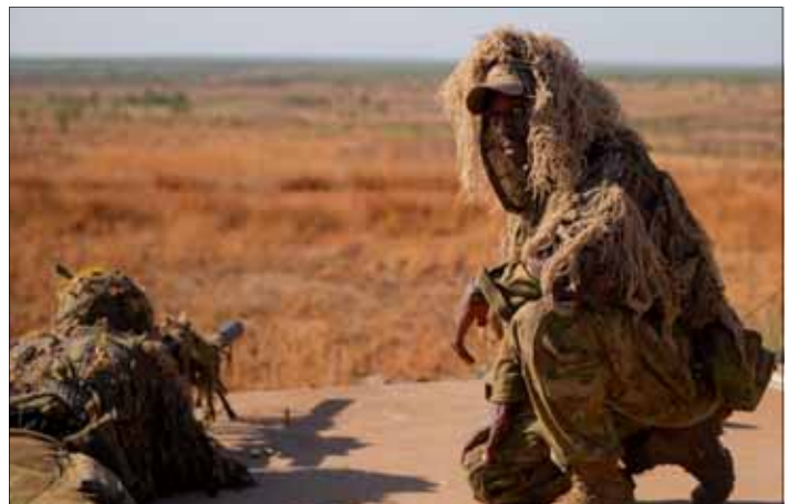
Soldiers from the 5 RAR practicing lethality during the Sniper Basic Course at Mt Bunday Training Area, NT.

Sniper outfits in the Australian Army are nicknamed ' yowie suit ' (also called 'ghillie suits'), named for their resemblance to the yowie, a mythical hominid which is said to live in the Australian wilderness.