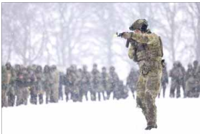
Snow Tigers from the 5 th Battalion, Royal Australian Regiment demonstrate section level attacks to Ukrainian recruits during Operation Kudu in the United Kingdom.