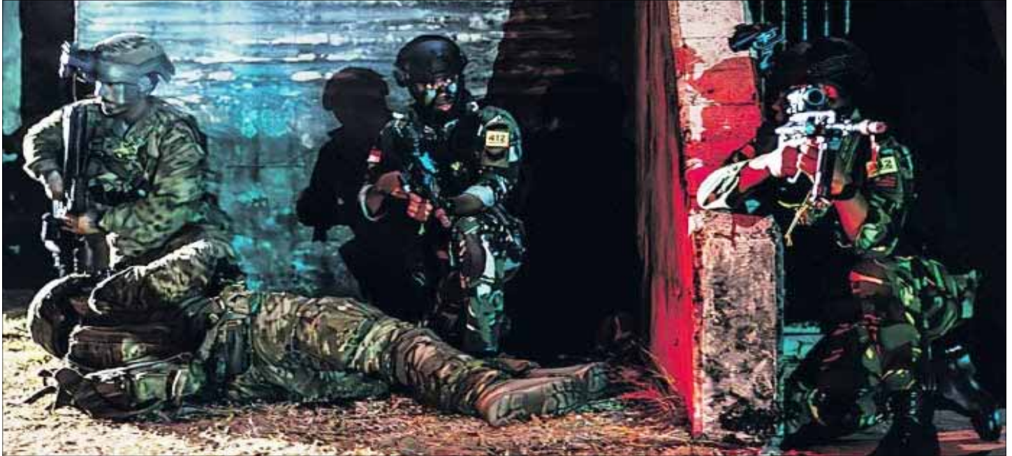
Australian Army soldiers and Indonesian soldiers conduct a night assault at the Darwin Military Museum at East Point, NT.

There were a lot of big smiles and hugs in the small receiving terminal at RAAF Base Darwin as the 5 th Battalion, Royal Australian Regiment (5 RAR) didn't just welcome a visiting company of soldiers for an exercise, but old friends from Indonesia's 412 Raider Battalion Kostrad (412Bn) back to the Northern Territory.